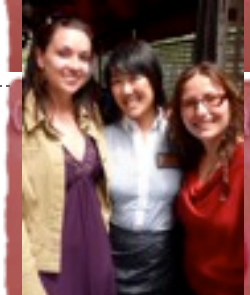
The New Capturetainment Team!