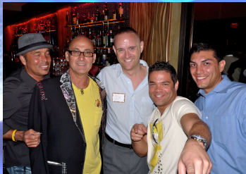
D-Alternative, ID Cuffs, Red Ox